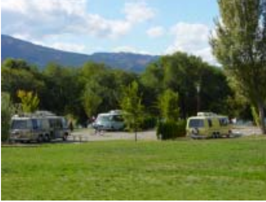
Campground Scenery #1