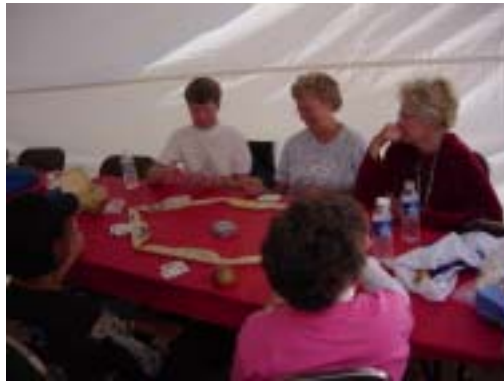
Playing Jokers and Marbles