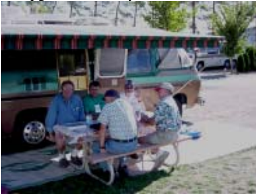
Talking Things Over at the Fishers' Coach