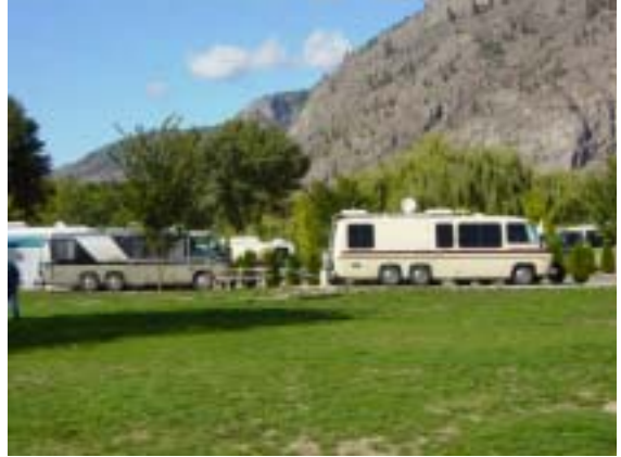
Campground Scenery #2